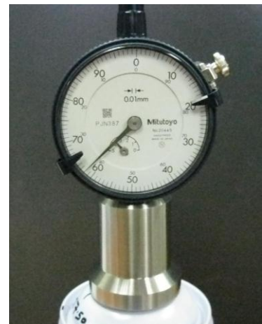
Figure 3: Using method