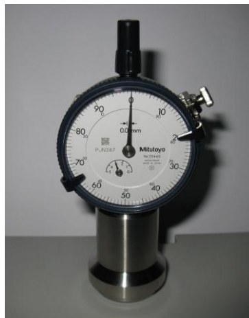
Figure 2: Calibration method